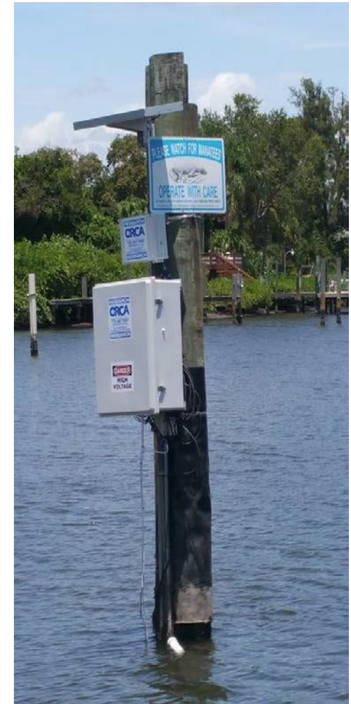
NuLAB monitoring nutrients in a waterproof enclosure on a Florida bay

Please contact Green Eyes to learn more about collecting high quality time-series nutrient data