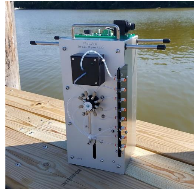
Green Eyes' NuLAB – Autonomous Nutrient Monitor

The NuLAB adapts established wet chemical methods to a field chemical analyzer. Precise volumes of sample, on-board standard and reagents connected to a rotary valve are mixed by a syringe pump and reacted solutions are analyzed in high precision colorimeters. In essence, the NuLAB is a rugged “chemistry robot” capable of various simultaneous analysis. Sample data is calibrated via preserved on-board standards that are analyzed at user specified intervals. Sample and reagent volumes, mixing times and flushing are controlled by straight-forward macros that can be customized by users or Green Eyes to achieve specific analytical goals.